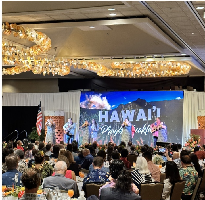
Ho'ōla Nā Pua attended and showcased our important mission on Friday, April 21 at the Annual Hawai'i Prayer Breakfast held at Hilton Hawaiian Village.